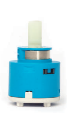
Cartridge without distributor. Specially designed for kitchen applications