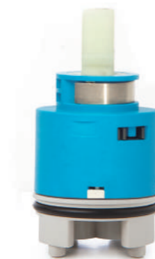
Cartridge with distributor