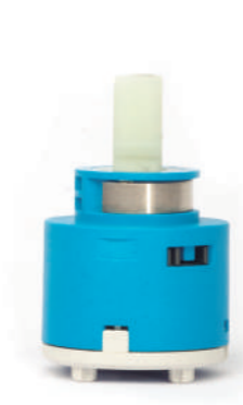
Cartridge without distributor